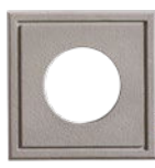
4- or 6-inch plate