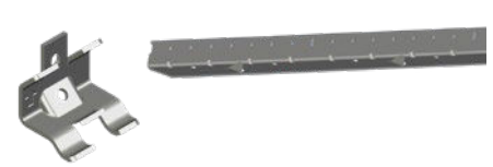
EziKi anchor and starter strip