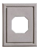
Junction box trim